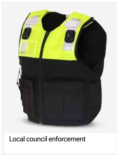
Local council enforcement