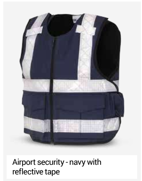
Airport security - navy with reflective tape