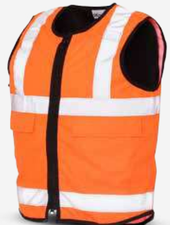
Two pocket tabard