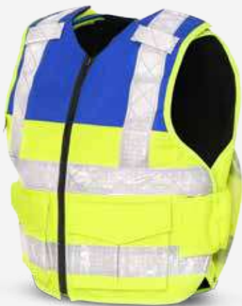
Hospital Parking Security