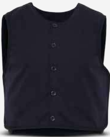
US Police uniform carrier