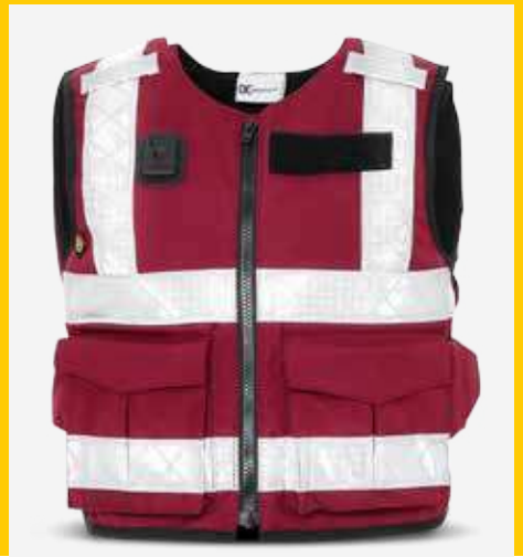
Local council overt vest in burgundy