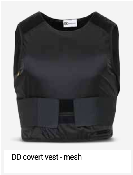
DD covert vest - mesh