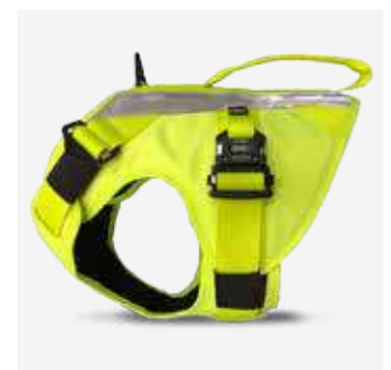
Available in hi viz Model DC-9000HV