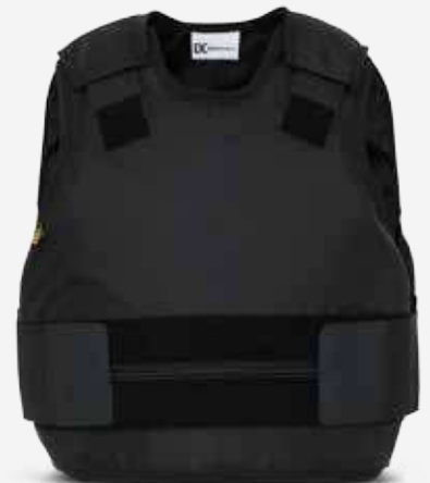
DC covert vest