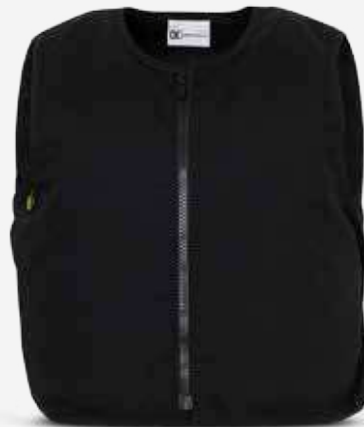
Door supervisor vest