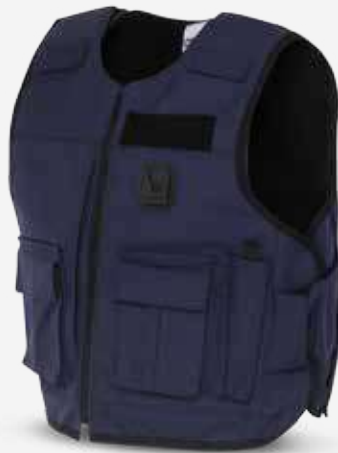
Hospital security with side entry and bespoke pipe pockets