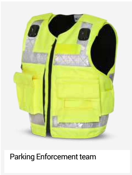
Parking Enforcement team