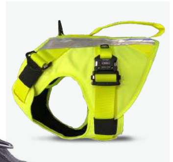
Available in hi viz Model DC-9000HV