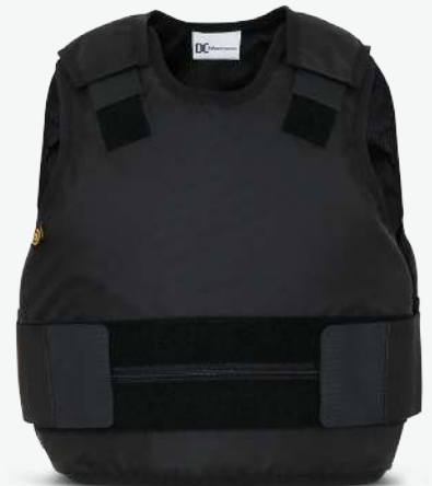
DC covert vest