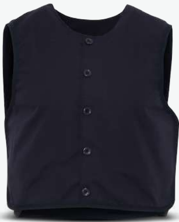
US Police uniform carrier