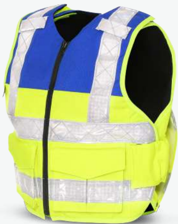
Hospital Parking Security