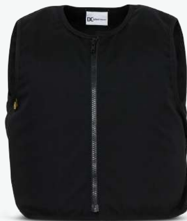
Door supervisor vest