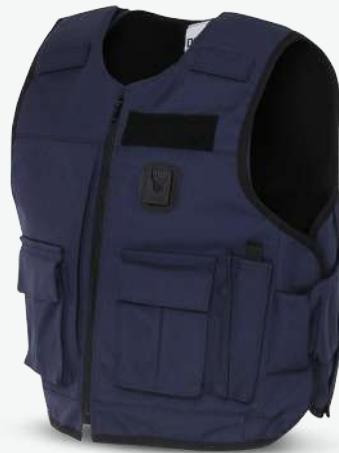
Hospital security with side entry and bespoke pipe pockets