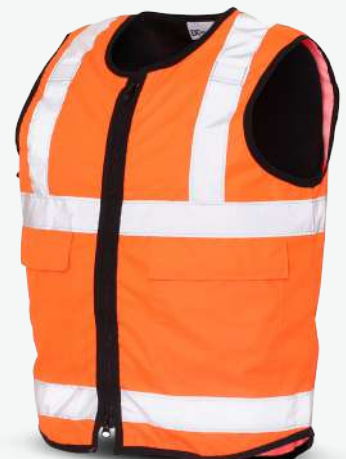
Two pocket tabard