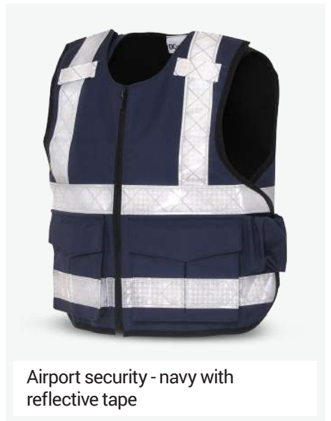
Airport security - navy with reflective tape