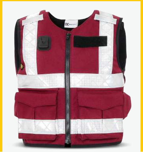
Local council overt vest in burgundy