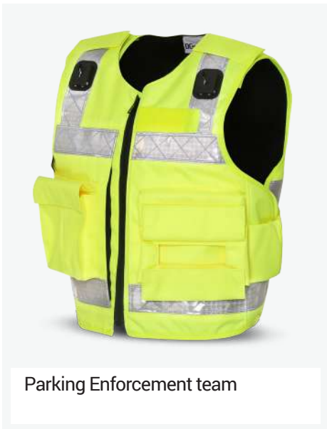
Parking Enforcement team