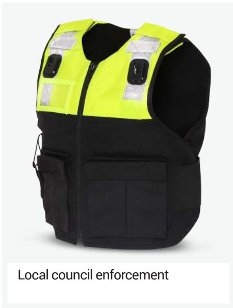
Local council enforcement